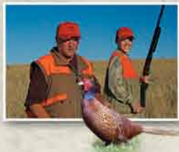
LIVE PHEASANT HUNT