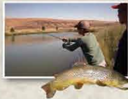
INTRODUCTION TO FLY FISHING